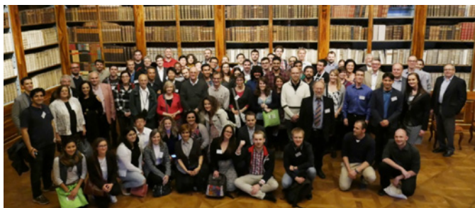
Visit to Strahov Monastery by Symposium participants